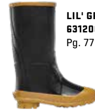
LIL' GRANGE 631200 Pg. 77