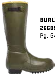
BURLY® AIR GRIP 266050 Pg. 54