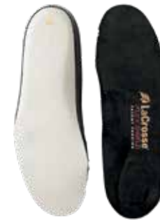
FLEX SHIELD INSOLE Pg. 80