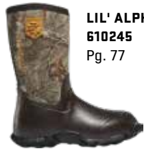
LIL' ALPHA LITE 610245 Pg. 77