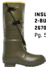
INSULATED 2-BUCKLE 267040 Pg. 55