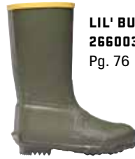
LIL' BURLY 266003 Pg. 76