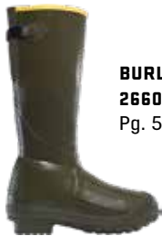
BURLY® TRAC-LITE 266060 Pg. 54