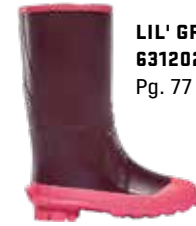
LIL' GRANGE 631202 Pg. 77

Looking for our other classic green rubber styles?