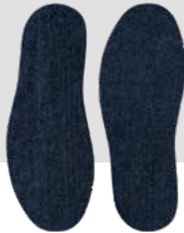
FELT INSOLE Pg. 80