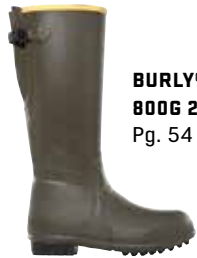
BURLY® AIR-GRIP 800G 266075 Pg. 54