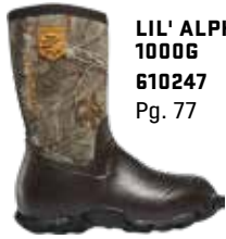
LIL' ALPHA LITE 1000G 610247 Pg. 77