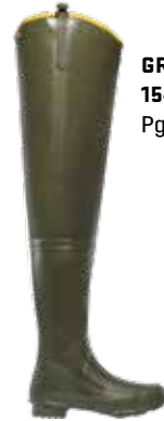
GRANGE® HIP BOOT 154040 Pg. 34