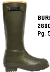
BURLY® CLASSIC 266040 Pg. 53

You can find them in the Utility section: