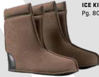
ICE KING® LINER Pg. 80