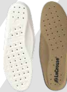
AIR CUSHION INSOLE Pg. 80