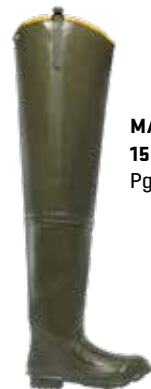
MARSH 156040 Pg. 35