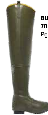
BURLY® HIP BOOT 700001 Pg. 34