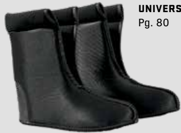
UNIVERSAL LINER Pg. 80