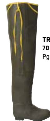
TRAPLINE 700066 Pg. 35