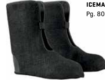
ICEMAN LINER Pg. 80