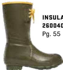
INSULATED PAC 260040 Pg. 55

You can find our classic green hip boots