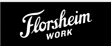
Steel Slatwall Header FLHEADER Dimensions: 24" X 9.75" X 1.13"