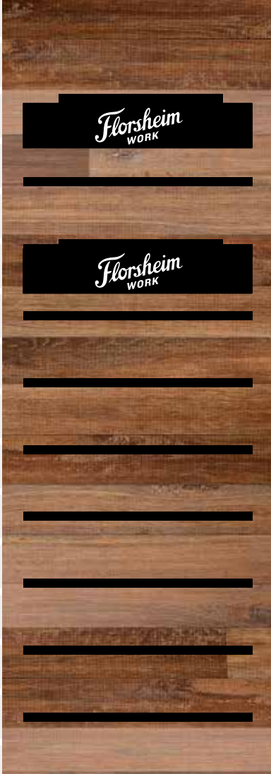
Slatwall Shelf PFGSW Dimensions: 2" x 10"