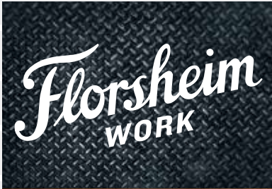
Styrene Slatwall Shelf Backer Dimensions: Designed to fit retail space