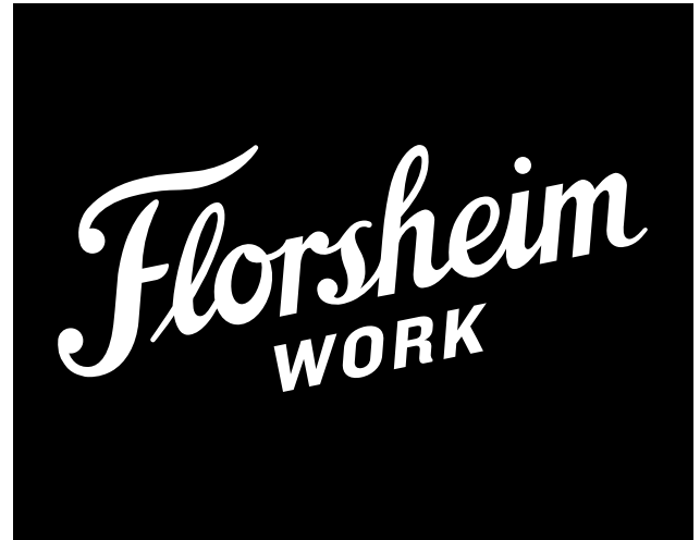
Carpet Logo Mat PFRUG